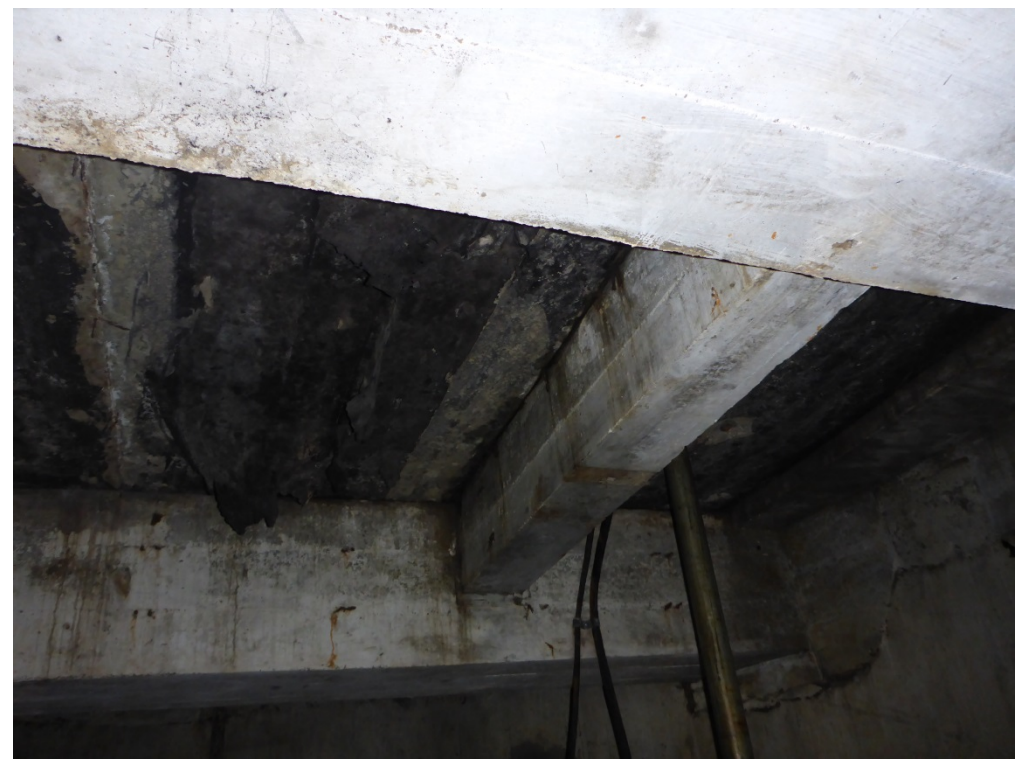
Figure 7: Existing Roof Structure