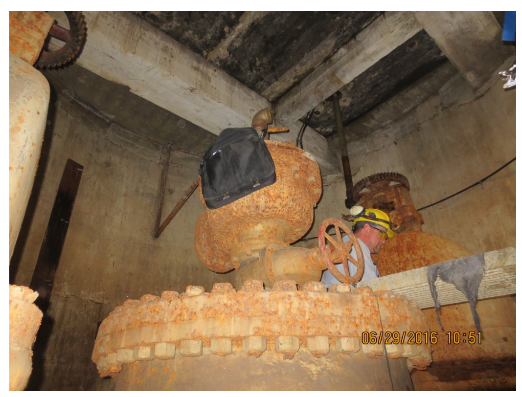
Figure 3 - Existing 200 mm Air Release Valve and 1200 mm Blind Flange