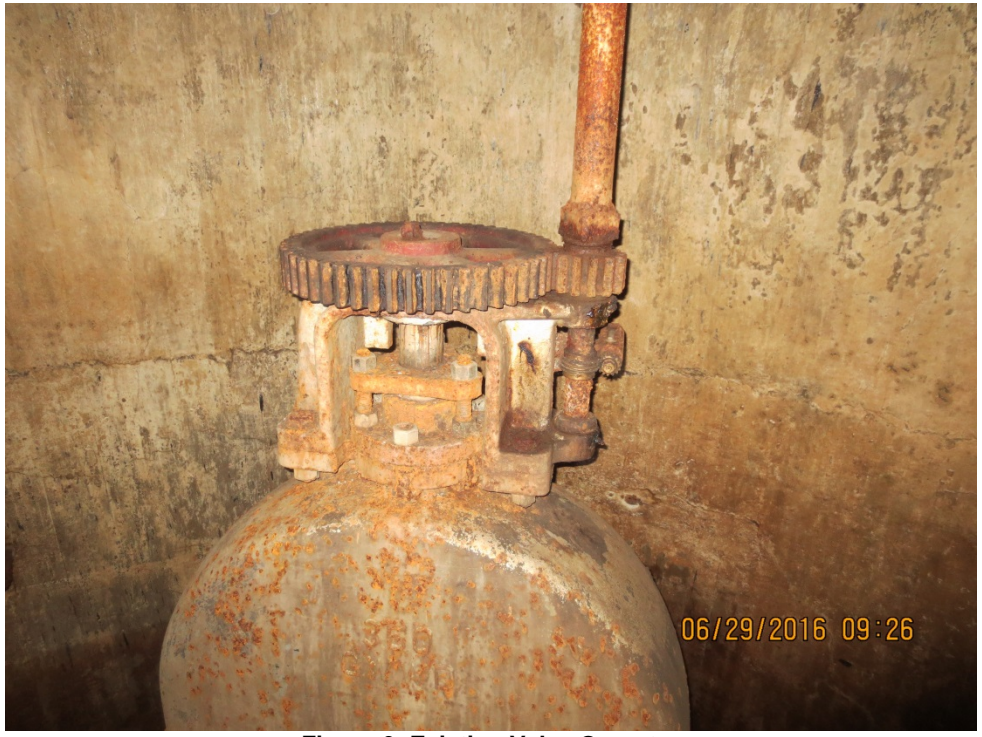
Figure 6: Existing Valve Operator