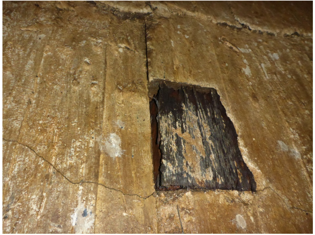
Figure 8: Existing Form Penetrations