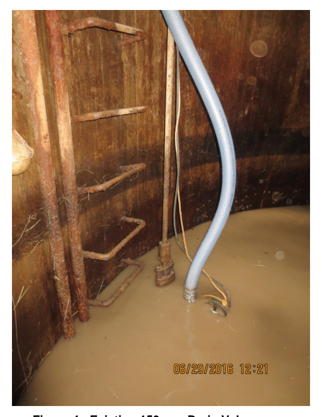
Figure 4 - Existing 150 mm Drain Valve