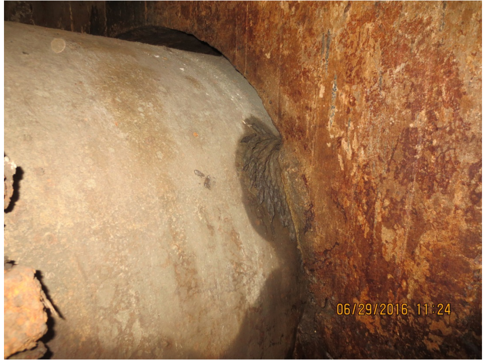
Figure 5: Existing Pipe Penetration