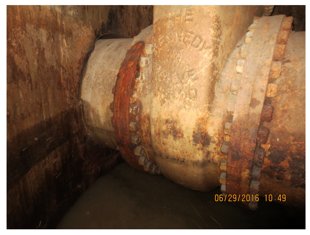
Figure 1 - Existing 1050 mm Gate Valve